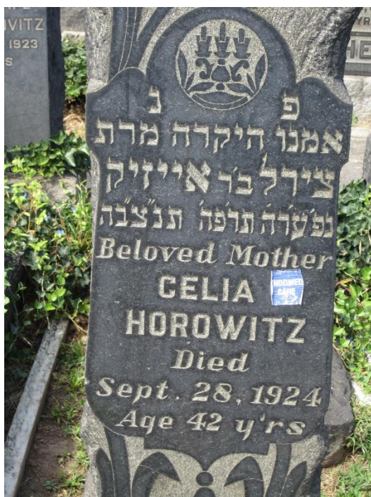
By 1924, next of kin and engravers used a combination of traditional Hebrew and English on headstones. Note the endowed (perpetual care) sticker on this grave of Celia Horowitz, born Tsirel, daughter of Azyk. The headstone also shows a particular style of monument to resemble a tree trunk. Photograph by the author, 2015.

Despite the vandalism, Epstein says of the Grove Street Cemetery, "This is the way it should be, like a museum," 4 echoing graveyard historian Lynette Strangstad's view that "early graveyards are outdoor museums." 5 As such, the Grove Street cemetery, a conglomeration of plots purchased by now defunct synagogues, organizations, and societies, represents a microcosm of the