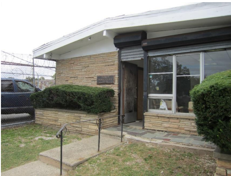
The former Grove Street Cemetery office of Raiken Memorials opens to the public on the annual Newark Cemetery Visiting Day. Note the barbed wire fencing to the left. Photography by the author, 2015.

Nestled between Grove Street and 20 th Street on the border of Newark's Vailsburg section