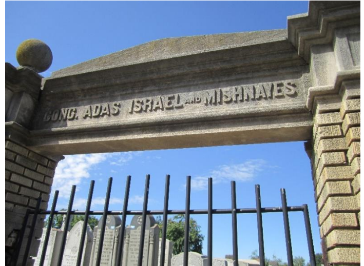
Gates and entries to sections of the Grove Street Cemetery are, for the most part, ineffective and/or illegible.

Synagogue burial societies and town-based societies known as landsmanshaftn initially paid for their Grove Street Cemetery plots. Former residents of a certain shtetl (village) or group of shtetlach formed a landsmanshaft —a Jewish immigrant benevolent society—to help them assimilate, acculturate, and socialize. But the societies also served another important function. Within each shtetl back home, a burial society or chevra kadisha cared for the proper interment, according to religious custom. Examples of congregations at Grove Street include Congregation Anshe Romania, Congregation Anshe Russia, and Congregation Toras Emes. Examples of landsmanshaftn include the Chechanovitzer Krankenunterstützungsverein or KUV, comprised of people from Chechanovitz, Poland (also known as Ciechanowiec in Polish). A KUV literally means “sick benefit society” and was similar to a benevolent society or mutual aid society. The Israel KUV was the first to establish a section of Grove Street in 1885. These could have been the nine hat makers who organized a KUV, discussed in The Essex Story , a history of the Jewish community in Essex County, and who served as a model for hundreds of other such groups. 9