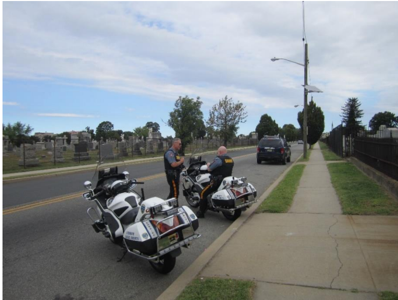
Members of the Essex County Sheriff’s Department police the area surrounding the Grove Street Cemetery on the annual visiting day, the Sunday between the Jewish New Year and the Day of Atonement, the holiest days of the year. Grove Street Cemetery is to the right; Holy Sepulchre is to the left. Note the difference in the gates between the two cemeteries.