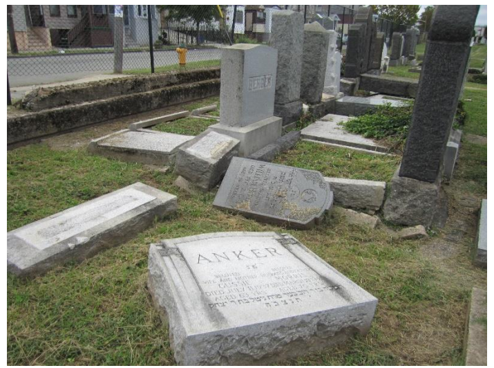
A trip to Grove Street Cemetery in September 2015 on annual visiting day yielded views of these toppled tombstones.

The Sanford B. Epstein caretaking company believes that rehabilitation would require the following: (1) repair of all toppled stones by fixing foundations and resetting the markers using epoxy; (2) repair of all sidewalks and roadways; (3) repair all fencing and replacement of gates to improve security; and (4) dismantling disintegrated archways. Internal hazards cause part of the safety issue, for example, the toppled stones and the broken sidewalks and paths. Three major challenges face proper maintenance: (1) the passing of the older generation who cared for the