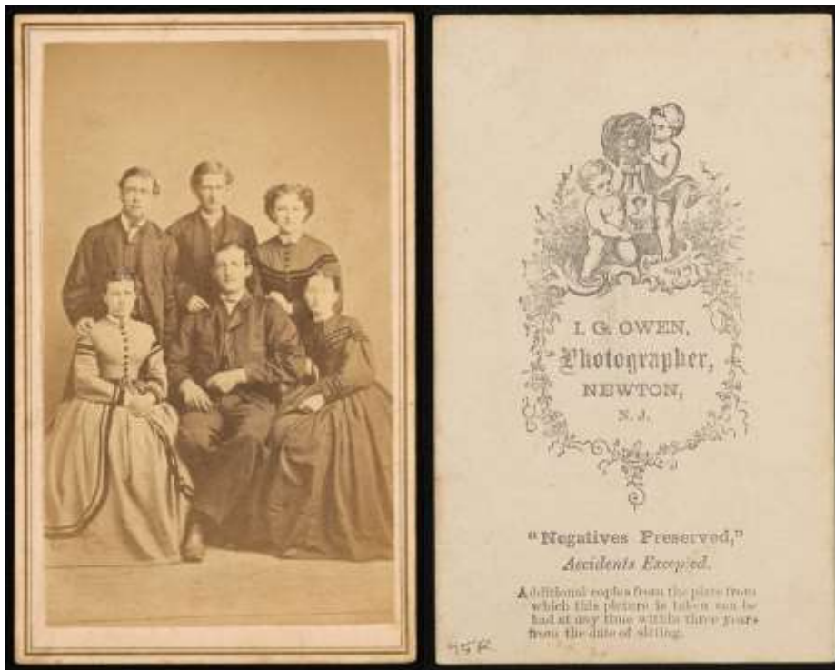
Group of six men and women, circa 1866–1870. Carte de visite, by I.G. Owen, Newton, New Jersey. Library of Congress. Recto and verso.

adopted that year by American photographers. 43 While it did not supersede cdvs in volume until the 1880s, by the early 1870s, cabinet cards had become commonplace.