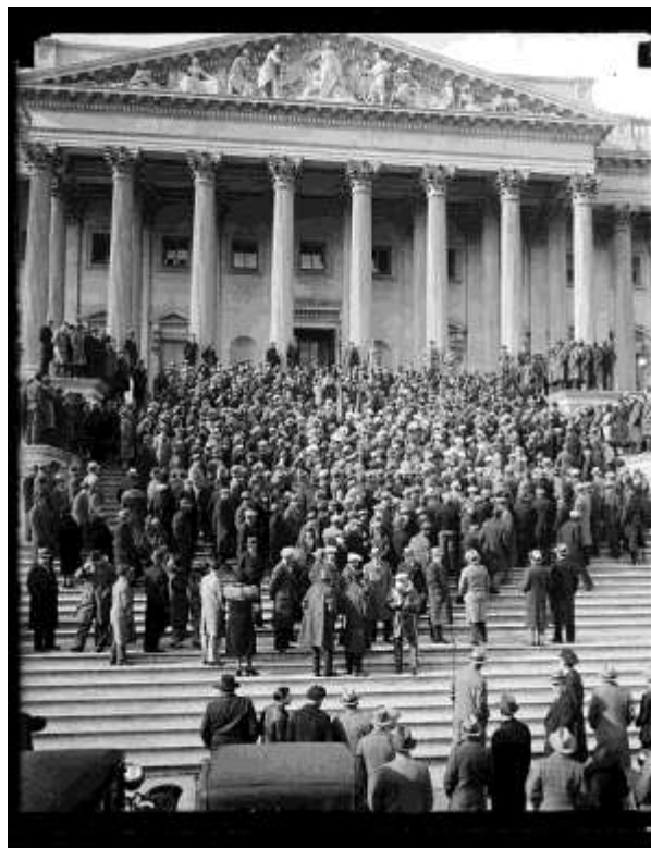
Veterans protesting bonus bill delay are addressed by Representative Wright Patman of Texas, January 1931

They were met on the steps of the Capitol building by Patman and several other representatives who accepted their petitions in support of the Texas legislator's bill. Patman addressed the assemblage justifying the payment as appropriate and well-earned by men who had served their country. "In asking for the payment of the face value of these certificates in cash now, we are not asking for the payment of a gratuity . . . Neither are we asking to raid the Treasury. We are simply asking for the payment of an honest debt heretofore confessed by Congress to veterans of the World war," a debt, he noted, that was "long past due." 39