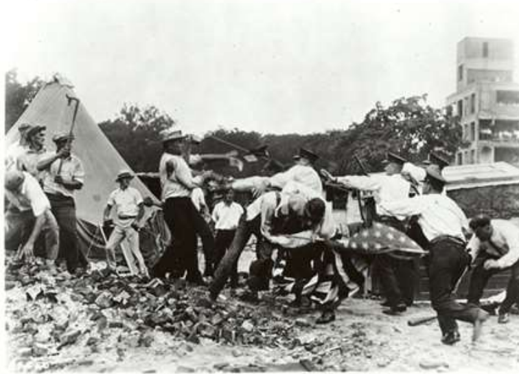
Bonus Marchers clash with DC police, 1932

the Bonus Army leaders that “the situation was becoming increasingly serious and that police could not be expected to indefinitely restrain themselves.” 95