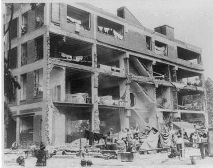
BEF encampment near an abandoned Treasury Department Building in Washington, DC, 1932

Adding to the fears of violence that swirled throughout the city were the persistent rumors that communists had infiltrated the Bonus Marchers. While the Bonus Army leaders maintained that suspected communists were an ineffectual minority, government and media reports continued to focus on the communist influence among the protestors, raising public suspicion of the motives of the remaining veterans. The U.S. Army Chief of Staff, General Douglas MacArthur, was convinced that the goals of the movement were “actually far deeper and more dangerous than an effort to secure funds from a nearly depleted federal treasury.” 94 At 10 a.m. on July 28, 1932, several DC police officers and Treasury agents successfully evicted veterans encamped in one of the abandoned Treasury Department buildings, a former national guard armory. Police cordoned off the area as more Bonus Marchers converged on the scene, rushing the police lines and throwing bricks from a nearby pile at the officers. Glassford warned