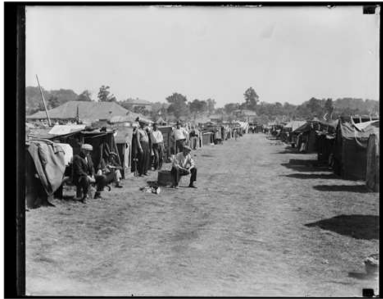
Bonus Army encampment, Anacostia Flats, Washington, DC, 1932