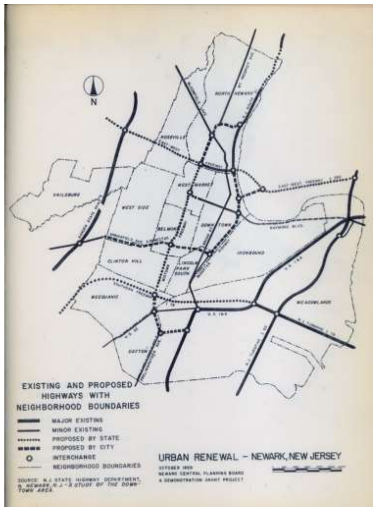
“Existing and Proposed Highways with Neighborhood Boundaries,” Urban Renewal Plan: A Demonstration Grant Project-2nd Interim Report (Newark, NJ: Central Planning Board, 1959).

Federal Interstates 78 (Southern Freeway) and 280 (East-West Freeway), respectively, made up the southern and northern legs of the loop. State highways 75 (the Midtown Freeway) and 21 (McCarter Highway), respectively, would make up the western and eastern legs completing the ring around downtown.