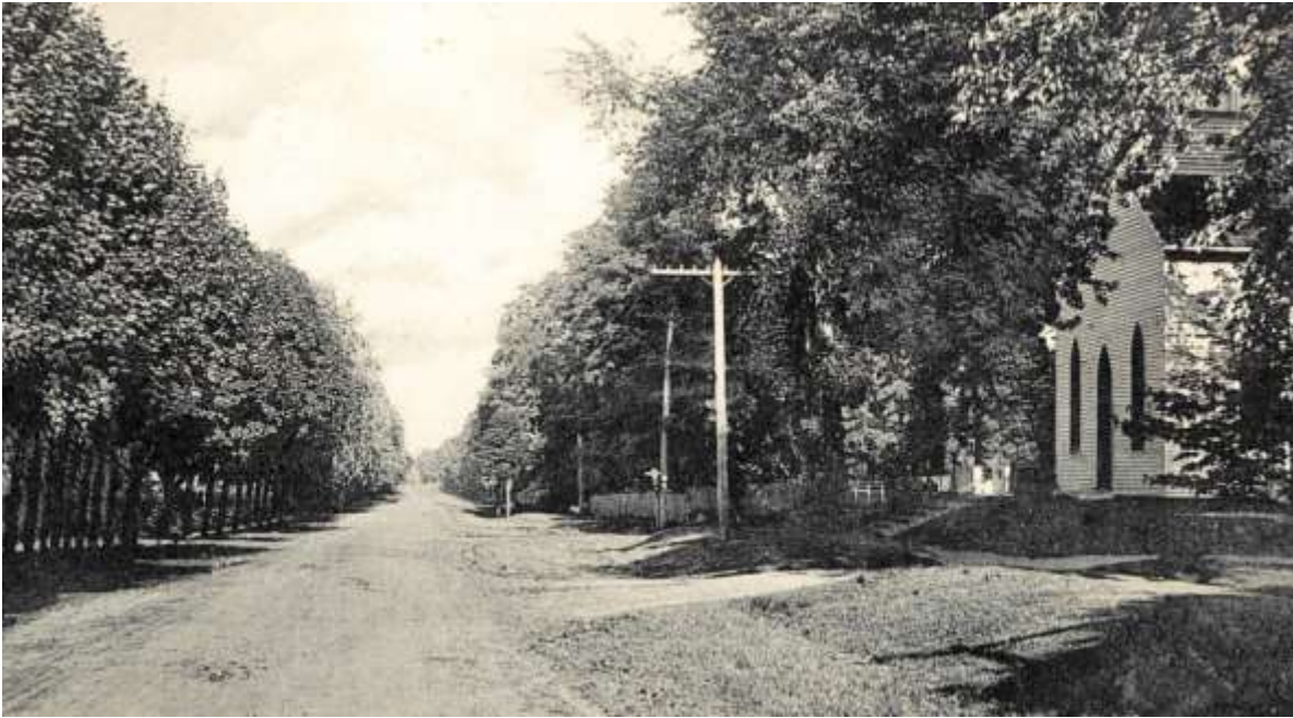
An early 20th century postcard view of King's Highway in Middletown, New Jersey, looking east with Christ Episcopal Church on the right. The image shows the ideal conditions of the road for holding horse-racing sprints.

1943. 40 In spite of all this misinformation, the Christ Church anniversary is a second known instance when the Van Dorn bowl was exhibited locally to the public.