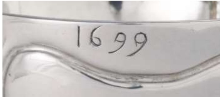
Detail of the engraved date on the Van Dorn silver bowl.