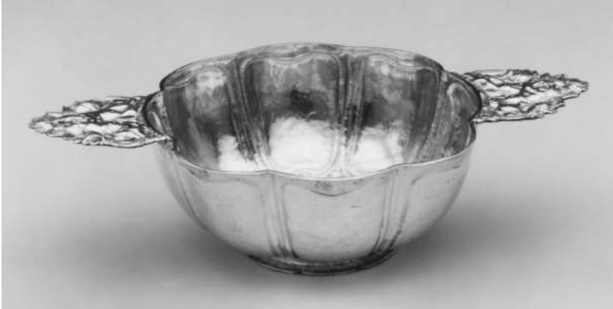
A silver brandewijnkom made in Haarlem, the Netherlands. It is dated 1682, features a round form, eight lobed panels chased with a design similar in shape to those on New York bowls, cast horizontal handles, and a simple rim foot. 2 1/4 inches high x 8 5/8 inches wide. Ex-collection E. Alfred Jones.

Museum of the City of New York, 11 the Museum of Fine Arts in Boston, 12 the Yale University Art Gallery, 13 the Winterthur Museum and Garden, 14 the Albany Institute of History and Art, 15 and Colonial Williamsburg, 16 in addition to the Van Dorn bowl at the Henry Ford Museum. Five of these bowls were made and monogrammed for early members of the Brockholst, De Peyster, Ten