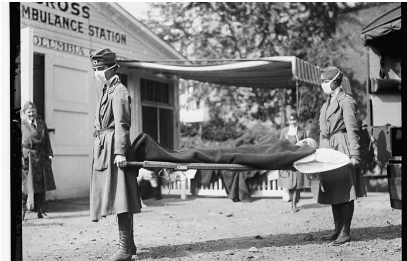
Demonstration at the Red Cross Emergency Ambulance Station in Washington, DC, 1918.