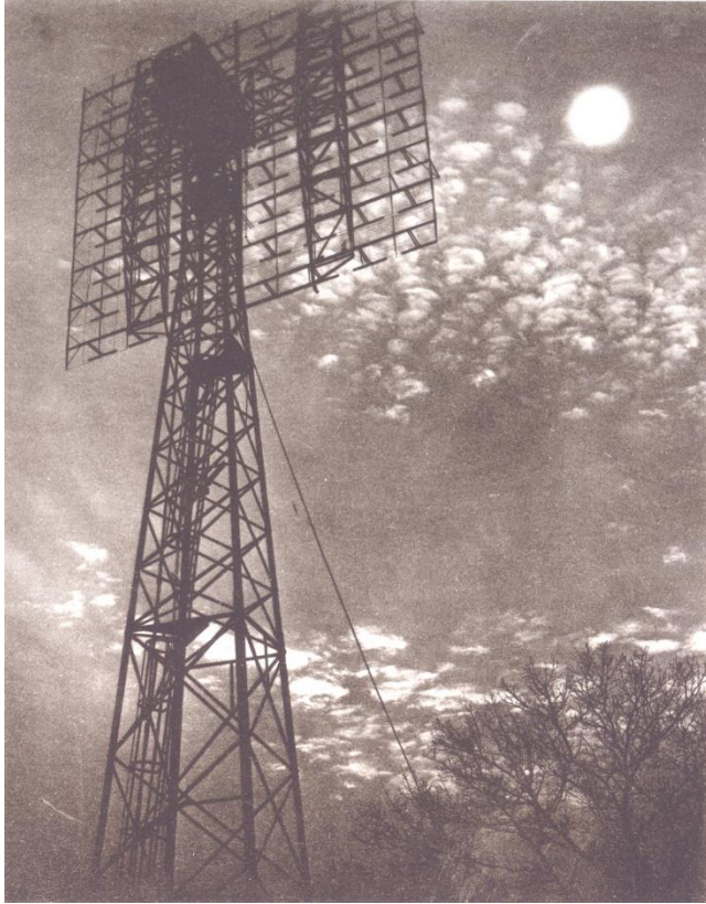
Diana Radar Tower