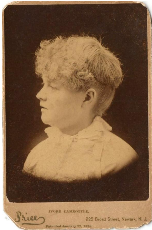
Frank H. Price, Newark. Woman. Ivory Cameotype carte de visite, early 1880s. Author's digital collection.

Most of the photographs found today with Price's Newark imprint are cabinet cards, which superseded CDVs in popularity by the 1880s. 35 One early example is an ivory cameotype with "Patented January 22, 1878" at the bottom under the image, which is of a young woman with short curly hair, bathed in intense light so that she looks somewhat like a marble bust, with the dark background facilitated by Price and Campbell's invention. Although relatively uncommon, dark backgrounds in vignetted portraits were also used by other New Jersey photographers in the 1880s without mentioning a patent. 36 Quite likely, they were influenced by Campbell and Price and may have used their apparatus.