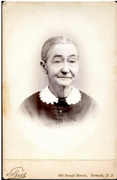
Frank H. Price, Newark. Elderly woman with retouched negative. Cabinet card, 1880s. Author's collection.

found than cabinet cards in Price's oeuvre are panel cards (4 x 8 1/4 inches), such as one of a bride who no doubt wanted the larger size to commemorate the special occasion. 38