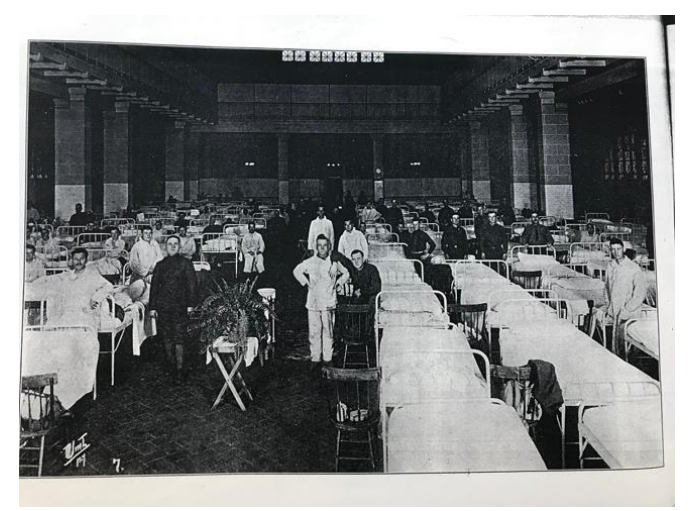
The great hall converted to a hospital ward, 1918.

The most symbolic act emphasizing the island's change of mission from immigration to the treatment of soldiers, was the conversion of the great hall into a hospital ward. On paper it was Ward 34, but to the inhabitants it was "The Big Ward." A 260 bed ward, it handled surgical, ambulatory, and some psychiatric cases. That 1,000 blankets, 1,500 sheets, 800 bath towels, and 500 suits