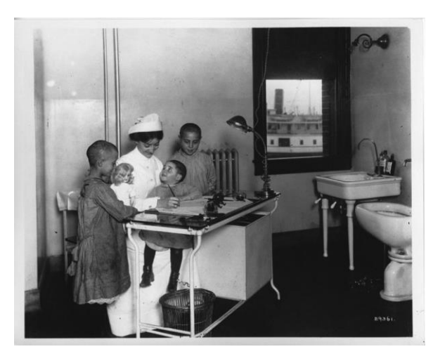
PHS nurse with immigrant patients.

Nurse Corps who transformed the Ellis Island Hospital into a temporary supply depot, training center, and mobilization point.