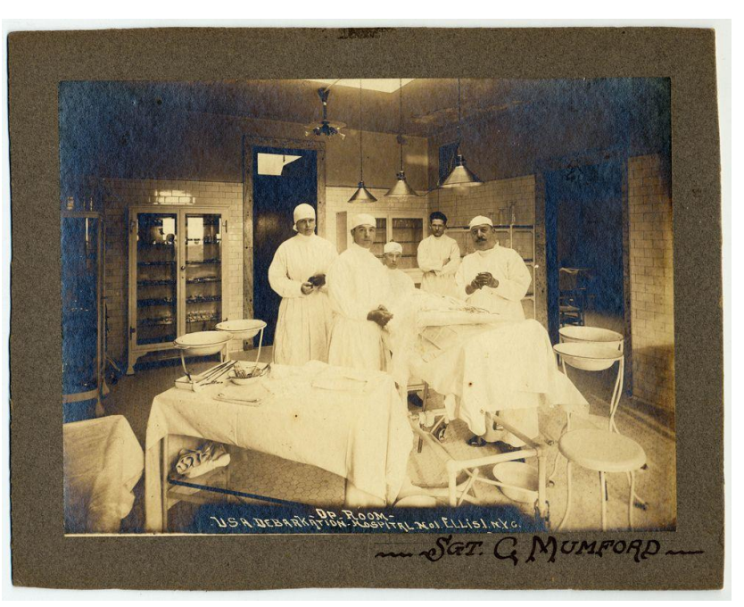
Army Surgeons in one of the operating rooms of the General Hospital.

Instilling and maintaining a sense of optimism, and the hope that these men could lead productive and fulfilling lives despite their injuries, proved to be just as great of a challenge. The war against disease and despair was a war in itself, whether it was fought by the PHS, the Red Cross, or the Army Medical Department. When the going was tough, these resolute