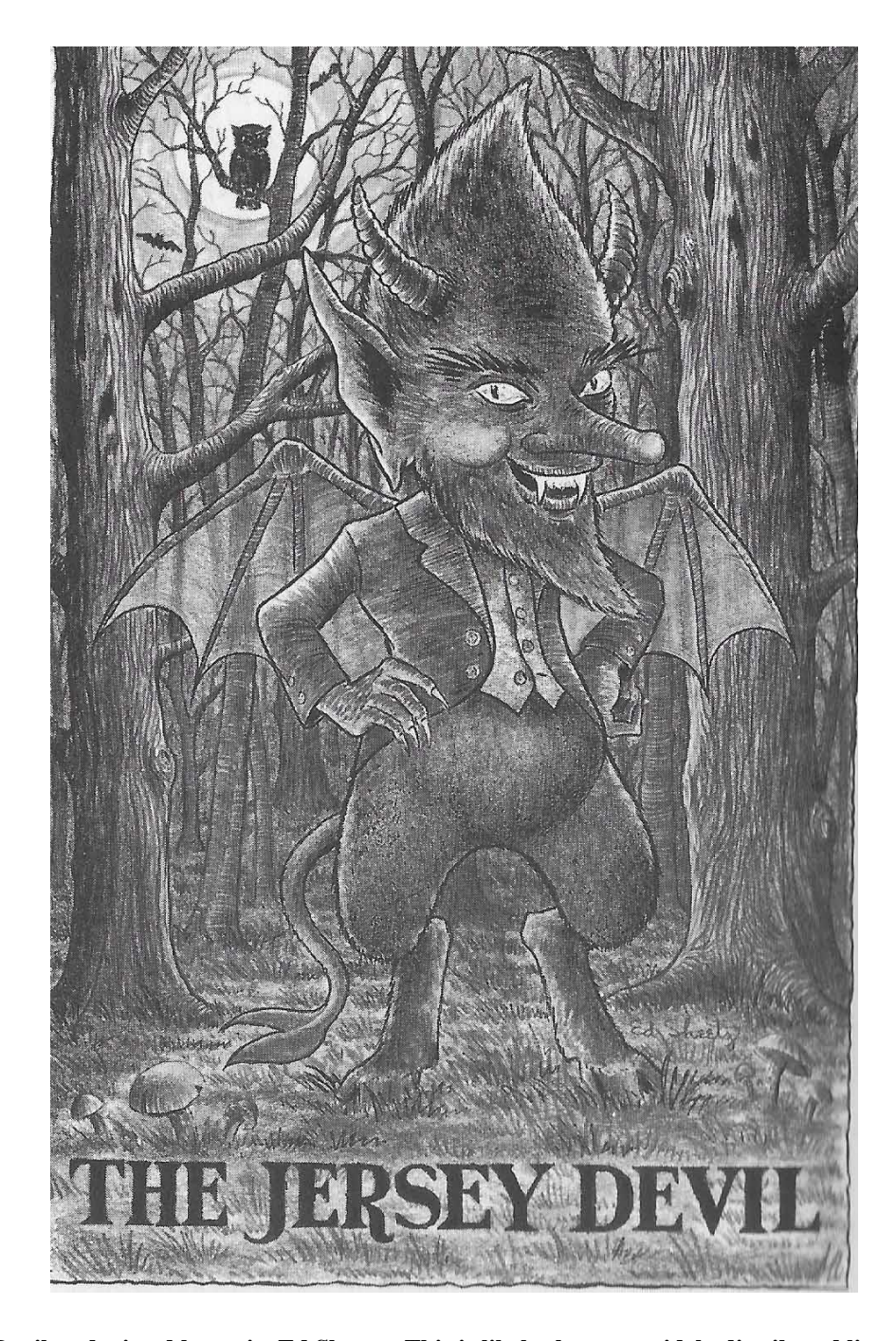
The Jersey Devil as depicted by artist Ed Sheetz. This is likely the most widely distributed lines of the Jersey Devil.<sup>39</sup> Here he appears to be a dapper bearded 18<sup>th</sup>-century Devil, complete with waistcoat.