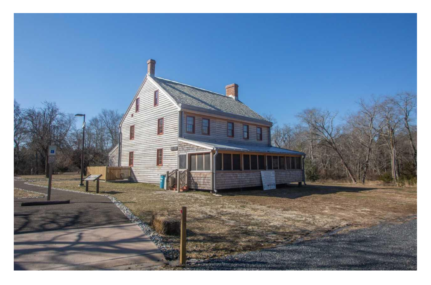
Cedar Bridge Tavern post restoration. The feature from which the coin was recovered was on the side of the building facing the reader.