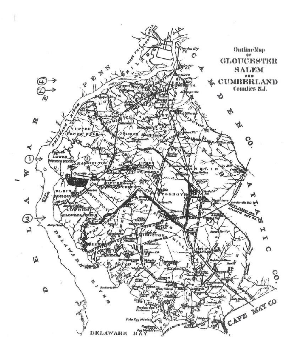
Henrietta Crawford's sequential residences in South Jersey

1 Mannington 2 Clarksboro 3 Vineland 4 Woodbury