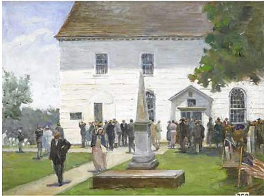
A Gathering at Old Tennent Church sold on 13 November 2010 at the Rago Arts & Auction Center in Lambertville, NJ. Oil on art board, 12" x 16," ca. 1935.