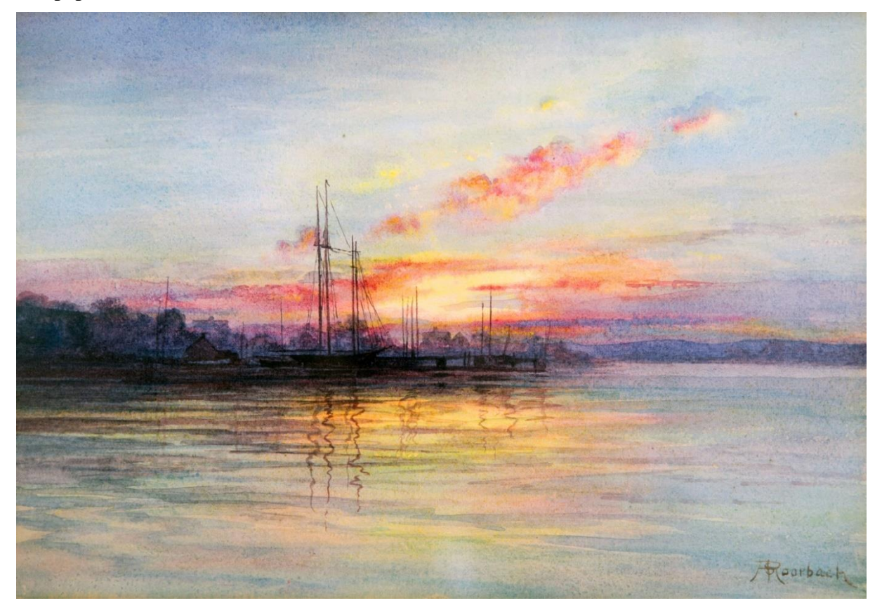
Keyport Waterfront at Sunset , ca. 1875 – 1879. Watercolor on paper, 8.5 inches high by 12.5 inches wide. Signed "A S Roorbach" lower right. Collection of the Monmouth County Park System, Lincroft, NJ.

manner. The identity of this artist remained elusive until the advent of internet search engines and such searchable online databases as Ancestry.com, GenealogyBank.com, and Newspapers.com.