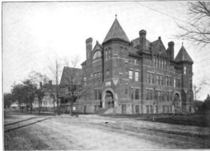
FIG. 1.—NEW JERSEY STATIONS—LABORATORY BUILDING.

Photograph, circa 1900, of New Jersey Hall, which housed the New Jersey Agricultural Experiment Station, the Entomology Department, and the Rutgers Insect Collection.