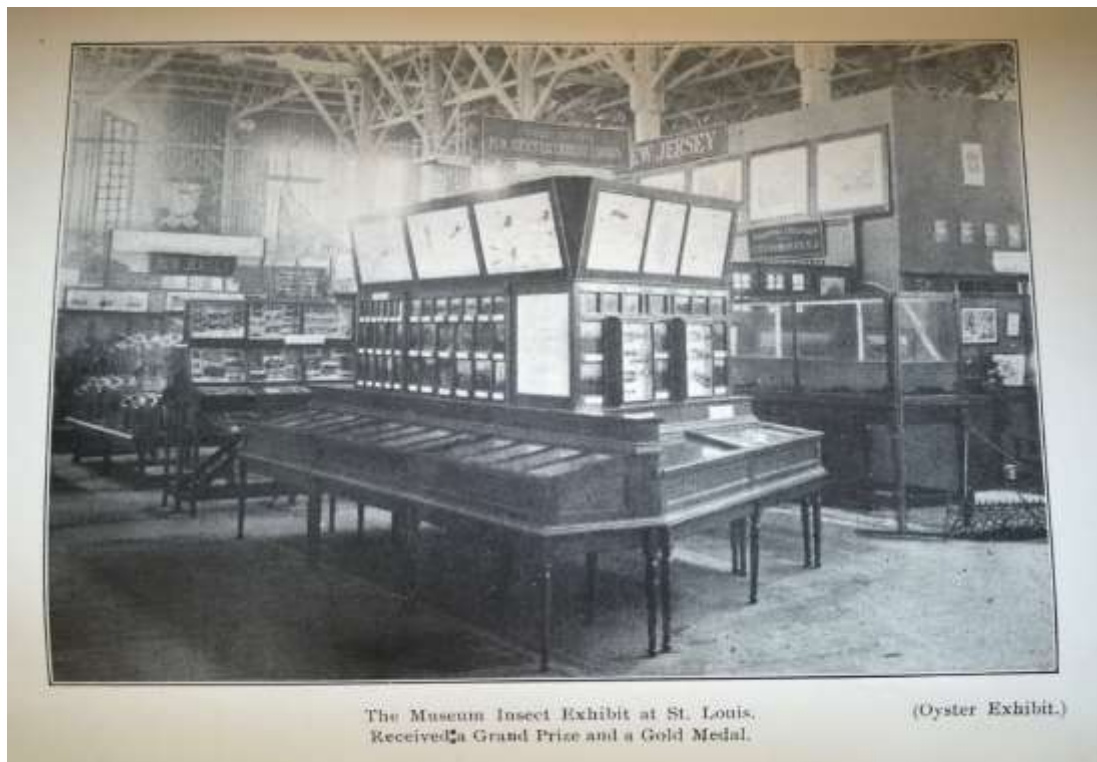
The Museum Insect Exhibit at St. Louis. Received a Grand Prize and a Gold Medal.