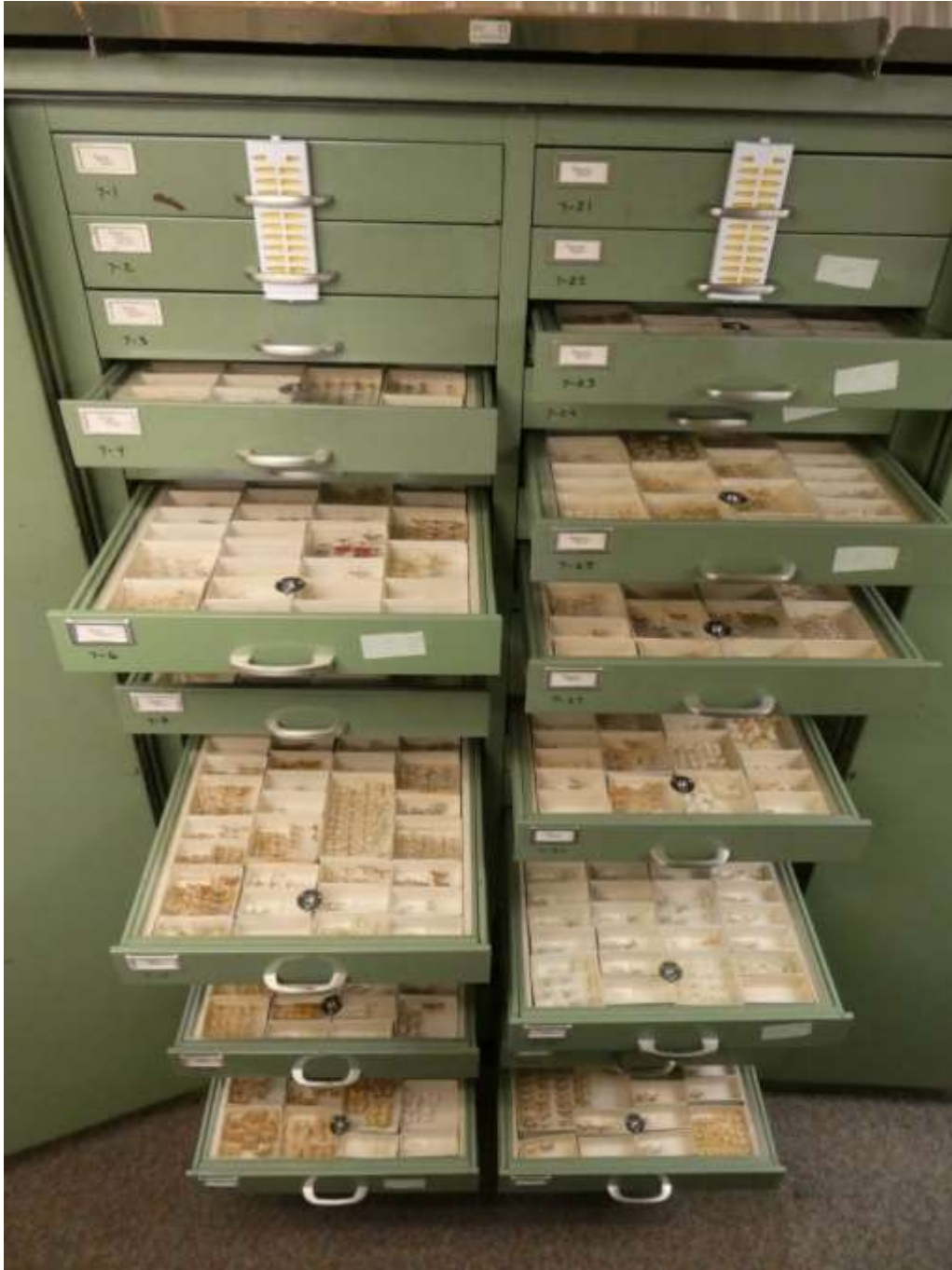
The majority of the Rutgers Insect Collection is currently stored in the green steel ceiling to floor cabinets purchased in 1957. Each cabinet has steel drawers with plexiglass tops that roll out for viewing.