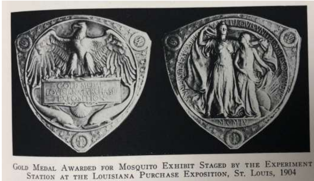
The Gold Medal awarded to the insect collection mosquito exhibit at the 1904 St. Louis Louisiana Purchase Expedition. 27