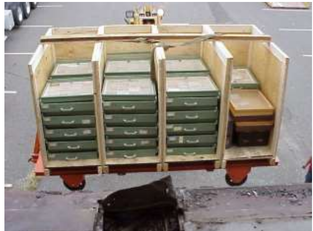
Photographs of the insect collection being removed from J. B. Smith Hall and transferred to McLean Laboratories.