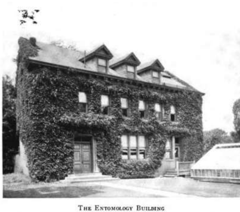
The Rutgers Entomology Building that housed the insect collection from 1912 to 1937.