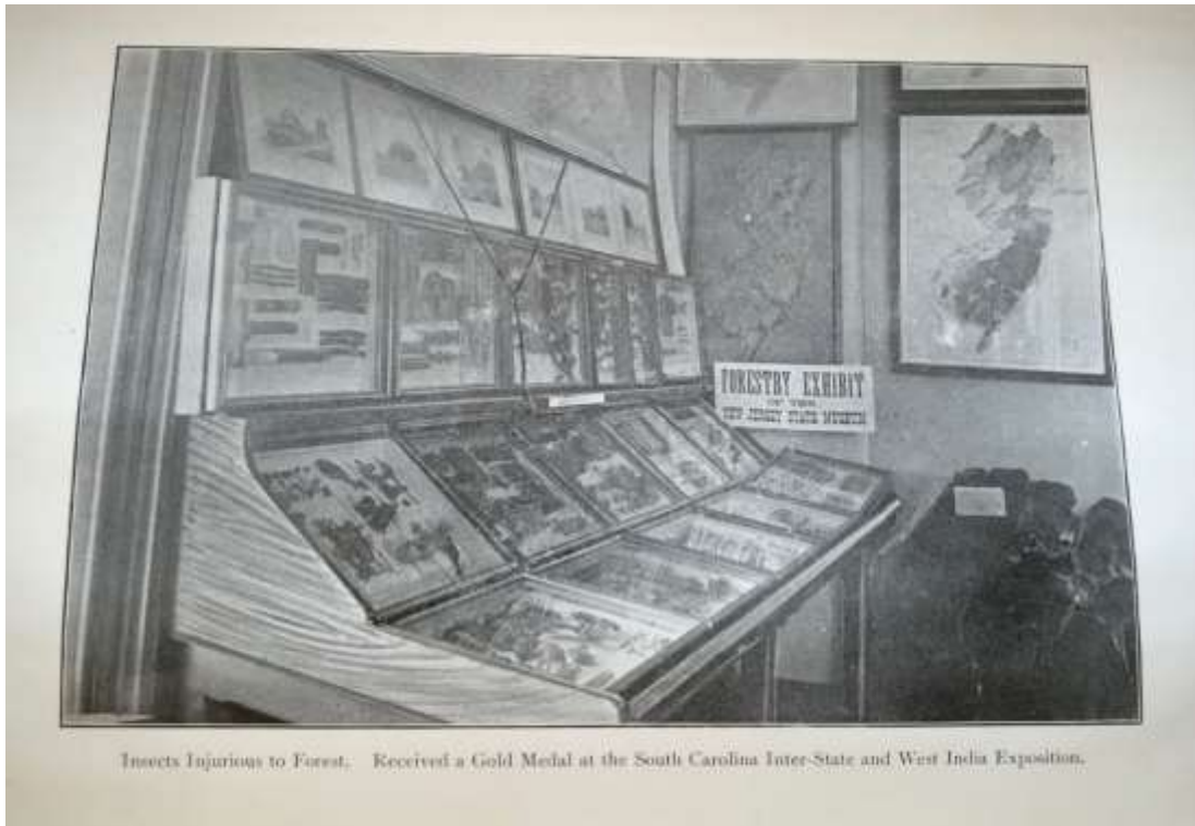
Insects Injurious to Forest. Received a Gold Medal at the South Carolina Inter-State and West India Exposition.