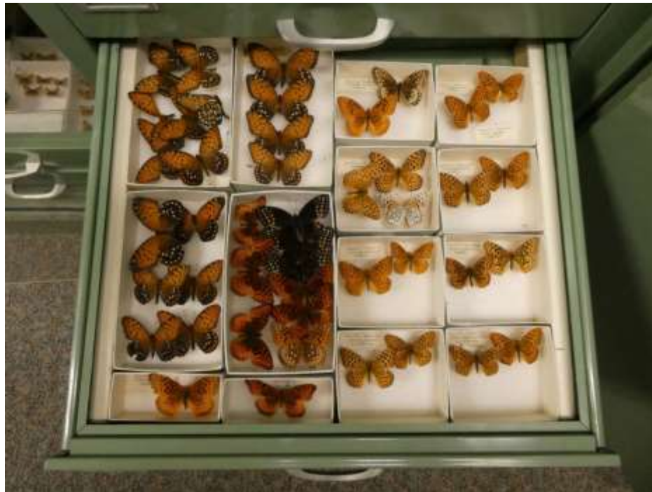
A Regal fritillary ( Speyeria idalia ) from the Rutgers Insect Collection collected on June 30, 1903 by William Comstock in Jamesburg, New Jersey (above) and a drawer from the collection showing additional Regal fritillaries collected in New Jersey (below). The Regal fritillary was last seen in New Jersey in the 1970s and is now considered extirpated.