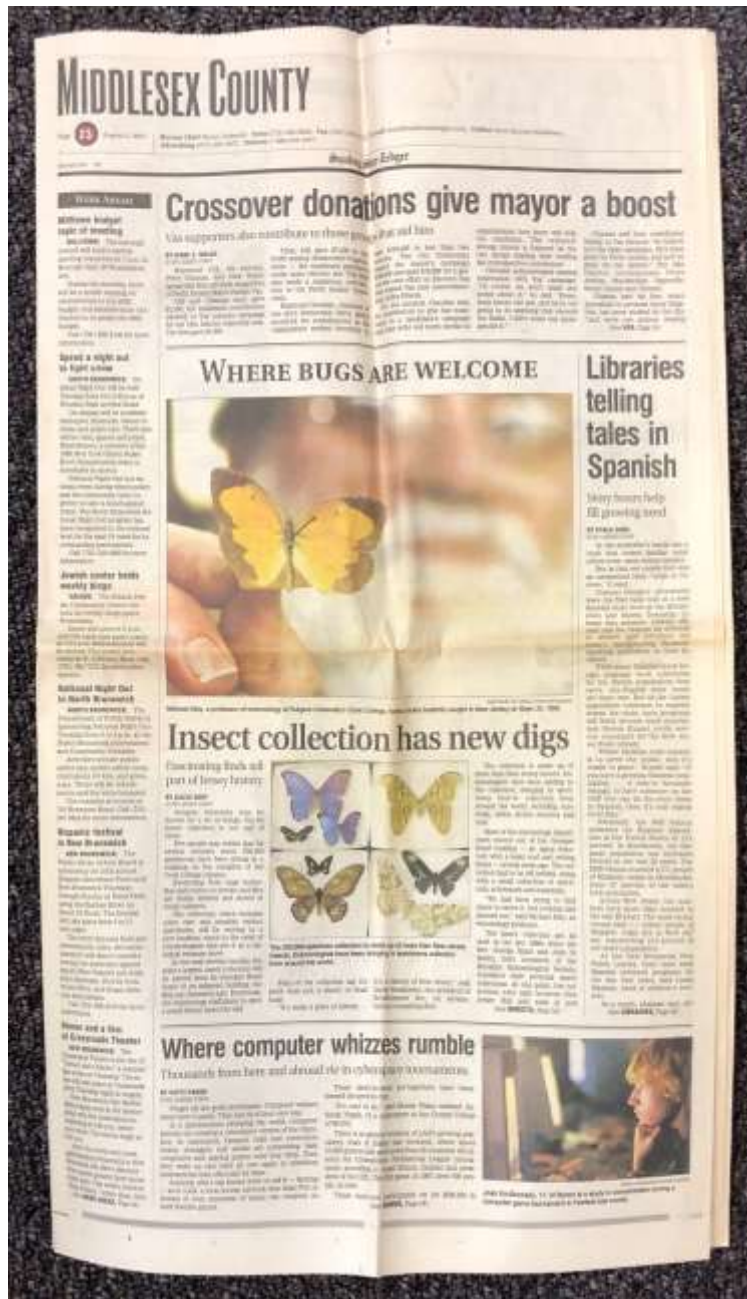
The Star Ledger article from August 3, 2003, featuring the Rutgers Insect Collection prior to its relocation to McLean Laboratories.

Just like the effort to save the insect collection in 1903, the 2003 relocation of the insect collection garnered media attention. For example, an article in the Sunday Star Ledger was titled, “Where Bugs Are Welcome - Insect collection has new digs.”