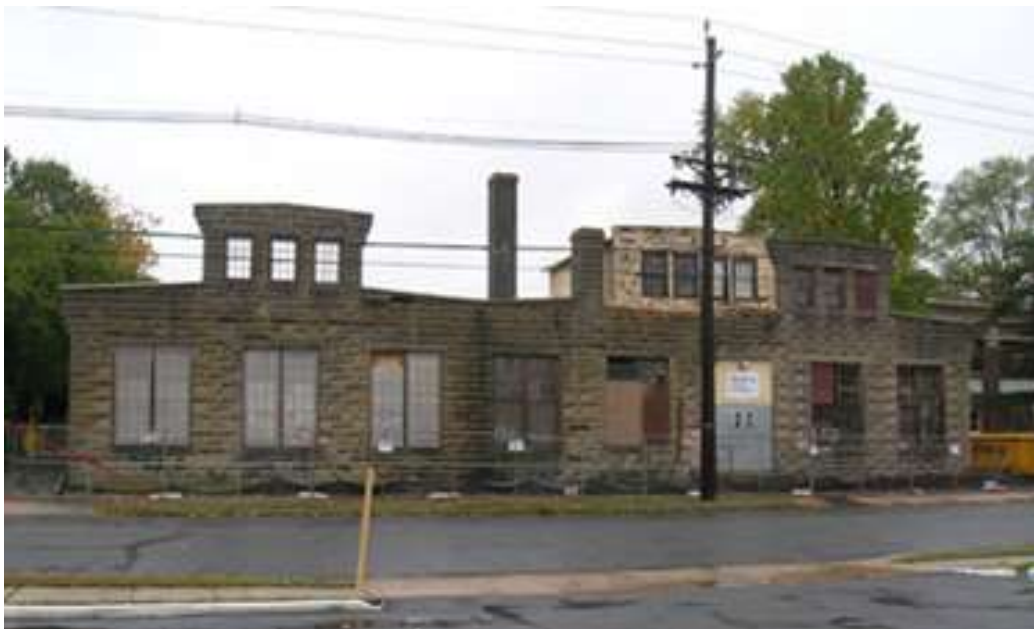
Photograph of the north wing of John B. Smith Hall shortly after the insect collection was removed in 2003.

Insect collections are extremely sensitive to disturbance and poor environmental conditions, and once affected, are unrepairable. The conditions in the building have deteriorated to the point that the collection has been moved into three separate rooms, each with different and unregulated environmental conditions, no fire control systems, and no security. Without immediate attention, the Rutgers Insect Collection will be irreparably damaged. 63