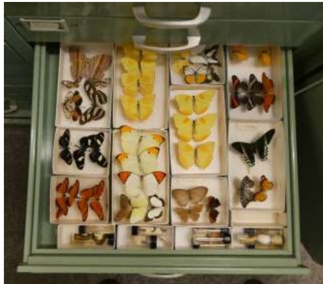
Drawers and Cornell wooden storage cases that house much of the insect collection. Each specimen is labelled with the collection date, location, and collector, and is arranged by taxonomy. Personal collection of the author.