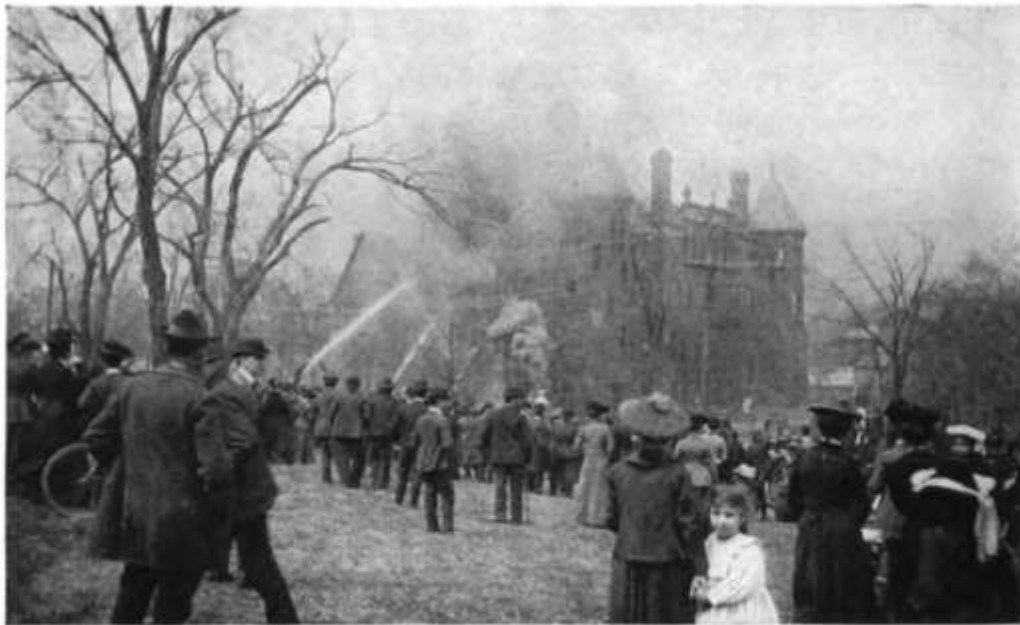
THE BURNING OF NEW JERSEY HALL, APRIL 23, 1903