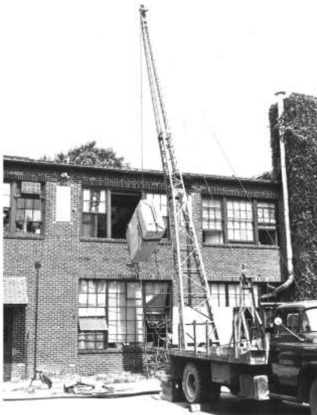
Photograph of the new insect storage cabinets being lifted by crane into John B. Smith Hall in 1958.