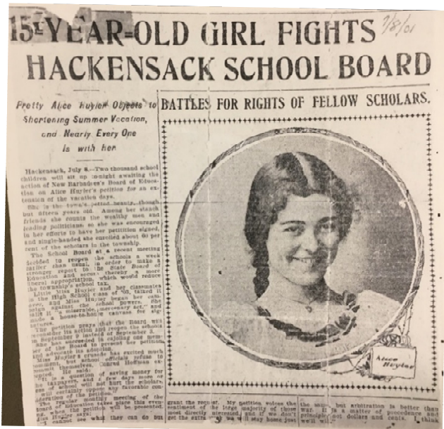
15-Year Old Girl Fights Hackensack School Board, 8 July 1901. News clipping held in the Alice Ramsey Collection, Archives & Special Collections, Vassar College Library.

The earliest years of her life are documented by her own hand, and reveal that she met her future husband, John Rathbone Ramsey, when she was 16 years old and a senior in high school in Hackensack, New Jersey, as she “walked to school each morning.” She may also have spoken to him when she organized a 1901 petition to stop the local school board from starting school “a week earlier than usual,” with a local newspaper account heralding her as the “town’s petted beauty.”