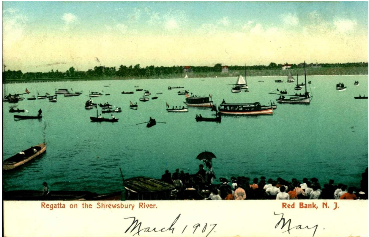
Regatta on the Shrewsbury River (1907)