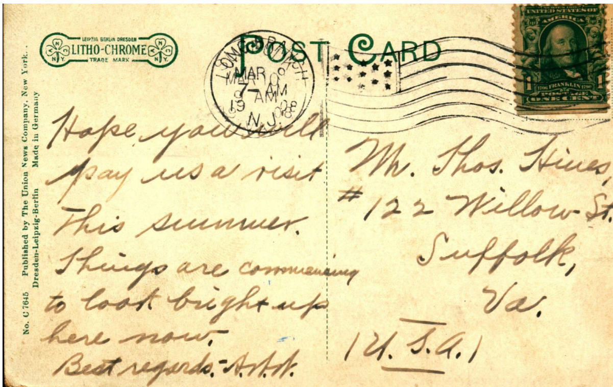
Takanassee Hotel, Long Branch, NJ (1908, reverse)