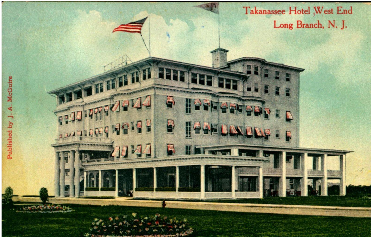
Takanassee Hotel, Long Branch, NJ (1908, obverse)